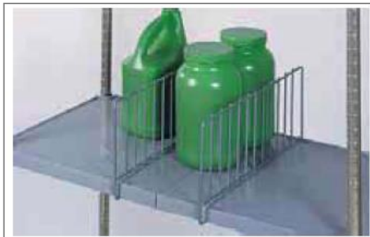
New Era™ Shelf Divider

AMCO • Freestyle • ISS • Kelmax • LPI • Universal Stainless • Gillis-Jarke