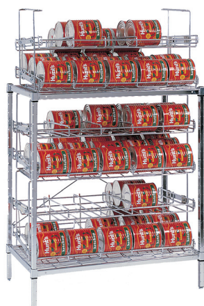
AMCO Take 10® Can Storage

Our shelving system finishes are designed to make you look good.