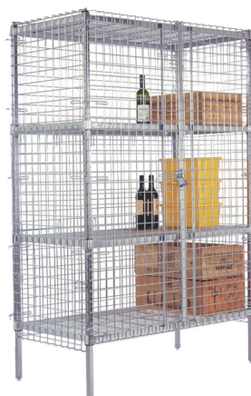
AMCO Security Unit