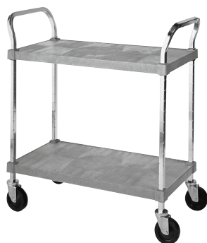
AMCO Plasteel Cart