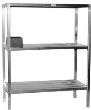
Kelmax Aluminum Fixed Shelving