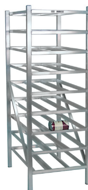
Kelmax Full Size Aluminum Can Rack (Stationary model)