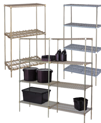
ISS Wire Shelving