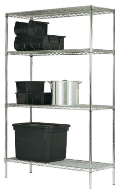
LPI Round Post Shelving