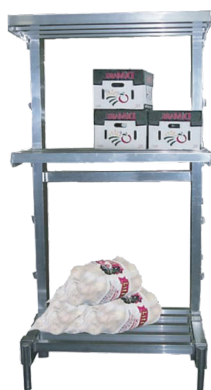
Kelmax Aluminum Cantilever Shelving