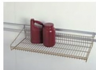
Flat Shelf with Lip