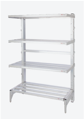
MODEL # 4H7207