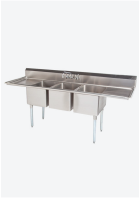
COMPARTMENT SINKS W/ 2 DRAINBOARDS