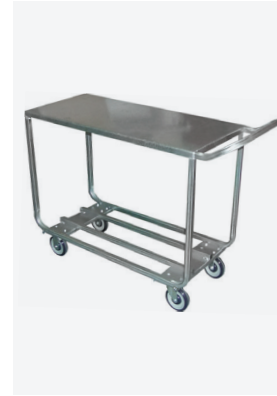
KELMAX® GALVANIZED STEEL STOCKING CART