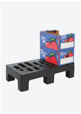
ISS® PLASTIC DUNNAGE RACKS