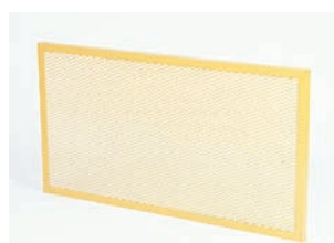
24" Screen Riser