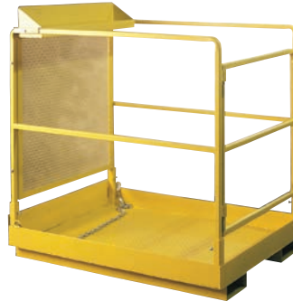
Swing gate type shown with optional tool tray