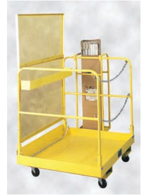
Model FWP44 shown with optional light bulb caddy, riser, tool tray and casters