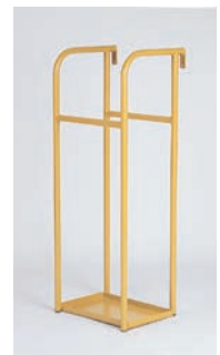
Light Bulb Caddy