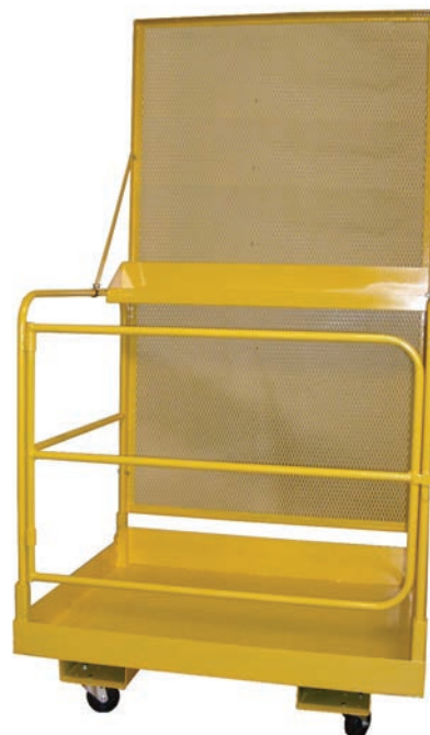
Shown with optional cal-osha riser