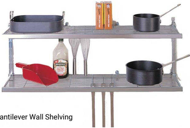
Cantilever Wall Shelving